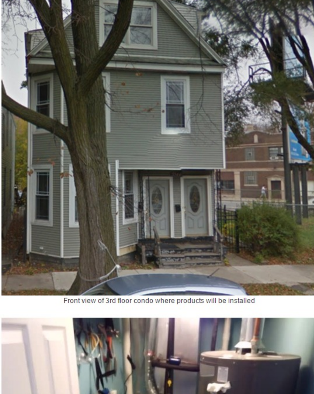
Front view of 3rd floor condo where products will be installed