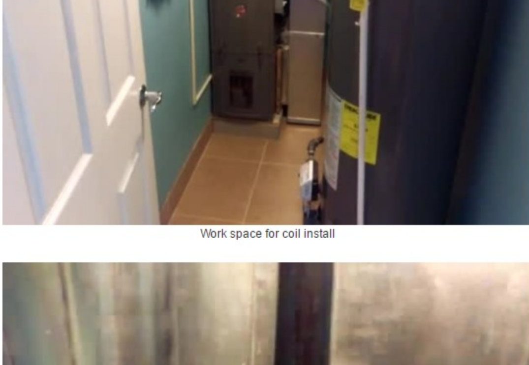
Work space for coil install