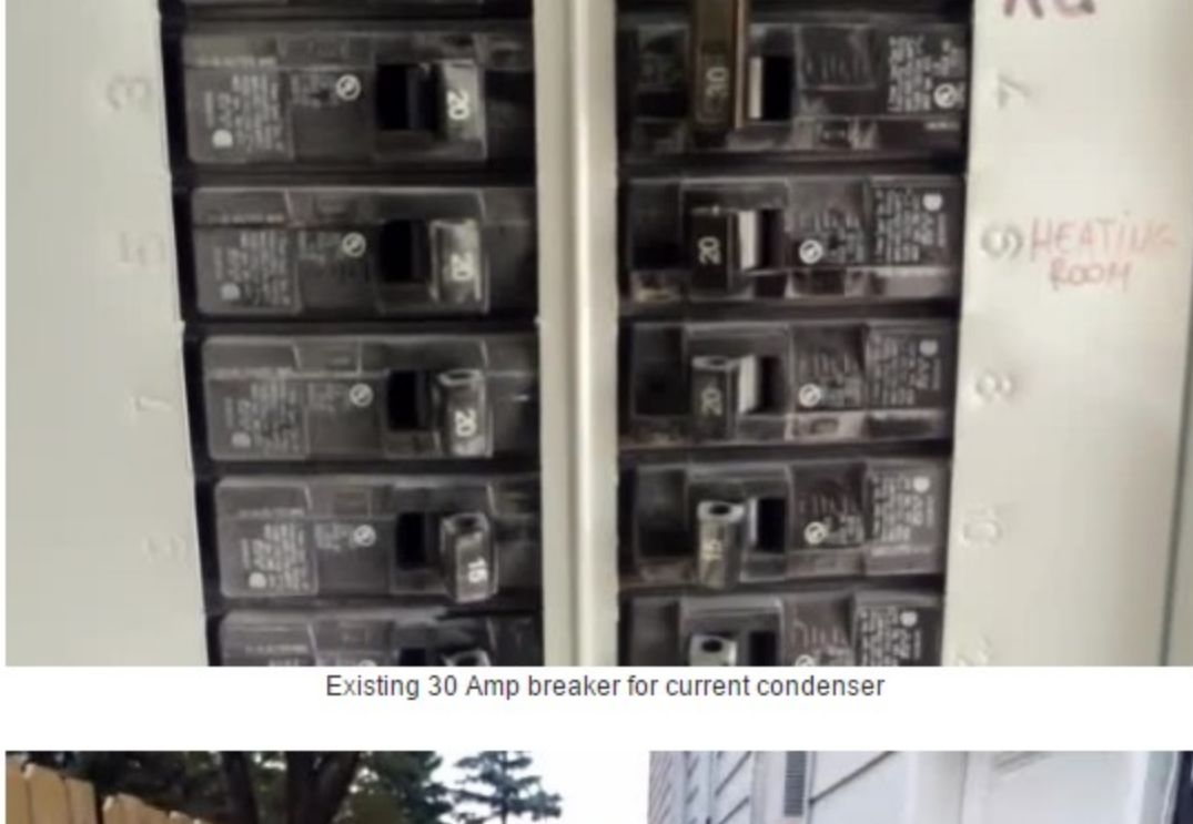
Existing 30 Amp breaker for current condenser