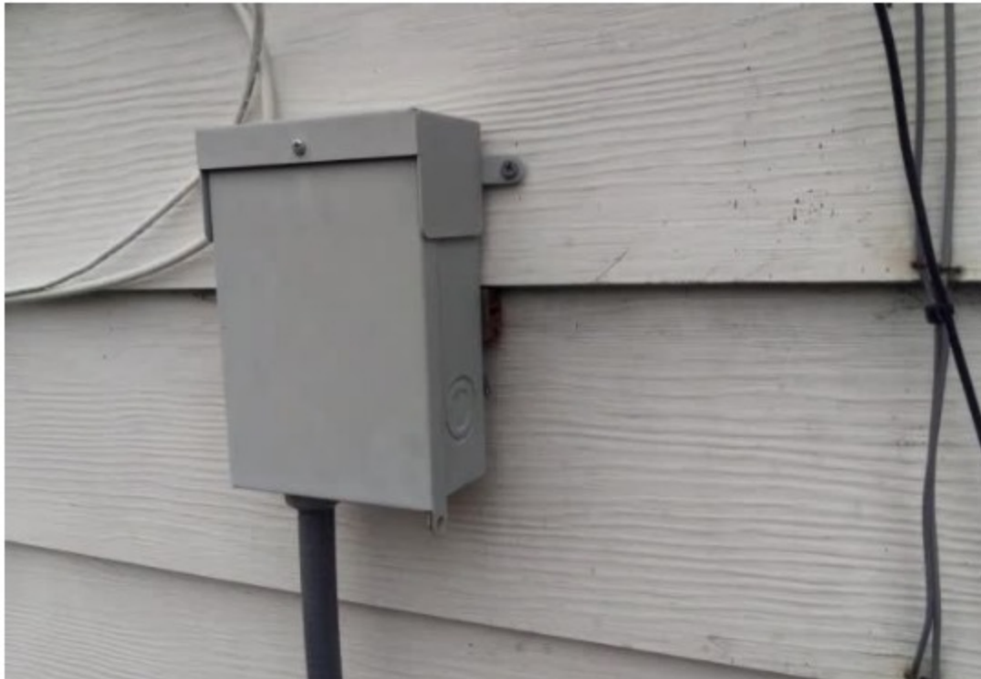
Existing disconnect that will be replaced