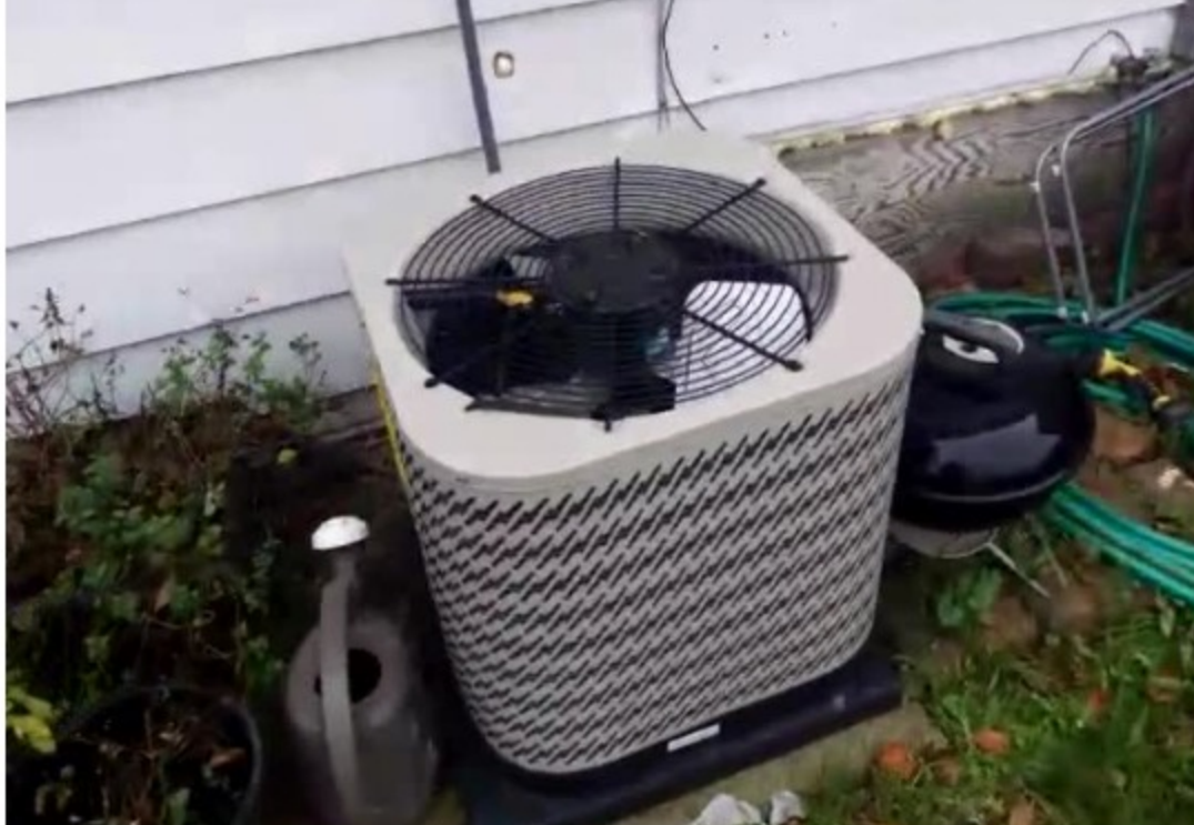
Condenser that will be replaced