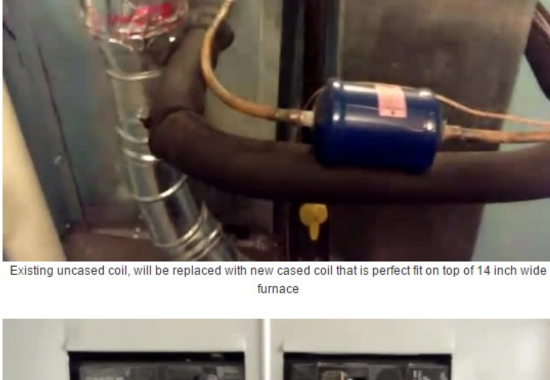
Existing uncased coil, will be replaced with new cased coil that is perfect fit on top of 14 inch wide furnace