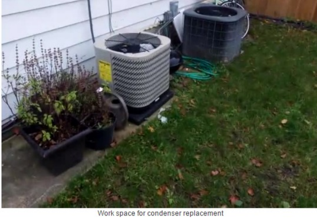
Work space for condenser replacement